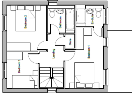
First Floor Plan (AS)