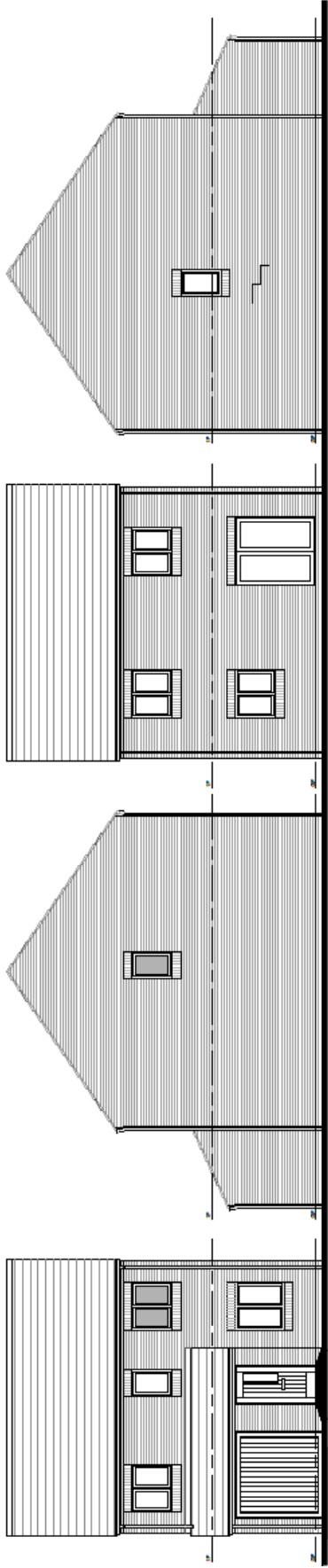
Front Elevation (AS)